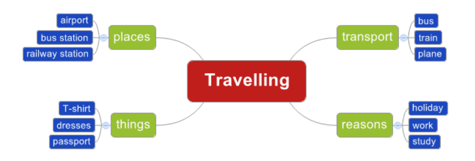
Fig. 3. The sub-topics of subtopics of Mind Map

Images or symbols and colour pens can be used to make the emphasis were needed. A Mind map can be made on computer, and then updated process will be faster and comfortable. But it will be useful for the primary school pupils to draw such Mind Maps as they will have better results while creating their own images for the key words and subtopics.